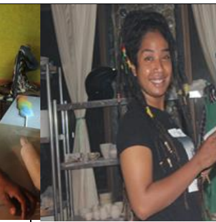
Suport tiem - Fifiana